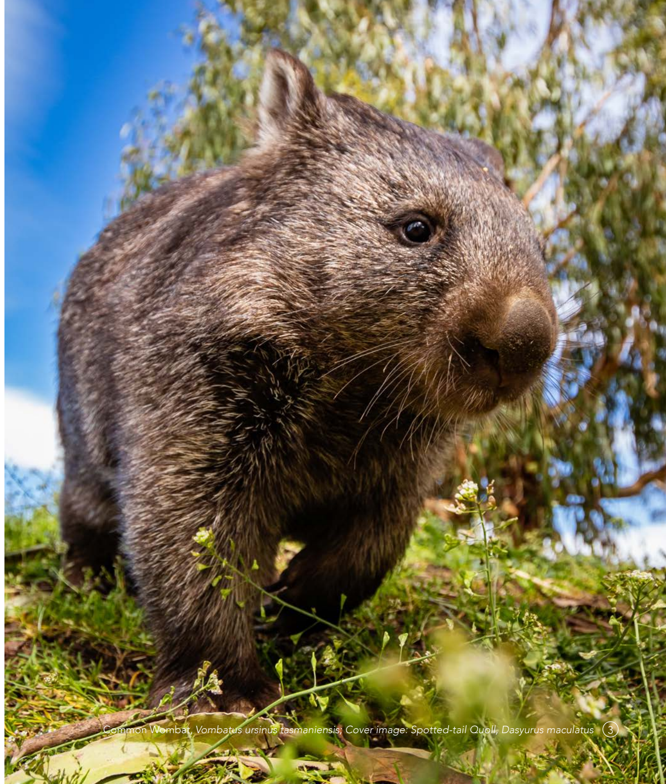
Common Wombat, Vombatus ursinus tasmaniensis , Cover image: Spotted-tail Quoll, Dasyurus maculatus ③