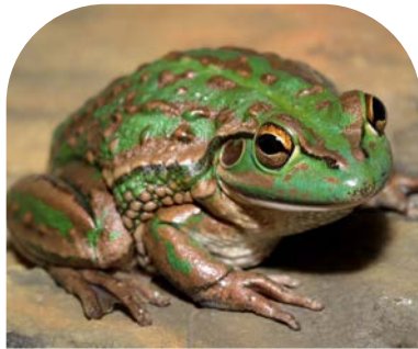
Southern Bell Frog Litoria raniformis

The grassy woodland habitat of this cryptic little bird was converted to wheat fields by early European settlers in the Coal River Valley. The quail adapted, but when sheep grazing replaced wheat, they lost their habitat a second time.