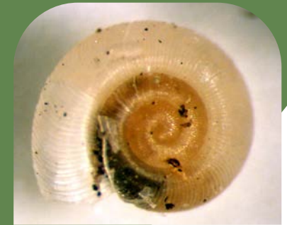
New snail species undescribed

In Tasmania this threatened native vegetation community has been extensively cleared. The trees provide habitat for the Critically Endangered Swift Parrot that have been recorded visiting the Coal River Tier.