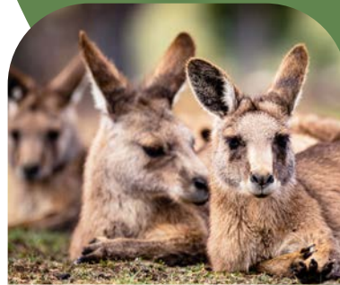
Forester Kangaroo Macropus giganteus

One of the few remaining populations of these frogs within southern Tasmania, occurs within the Coal River watershed, along Pages Creek and the nearby Ramsar-listed Pitt Water-Orielton Lagoon wetlands.