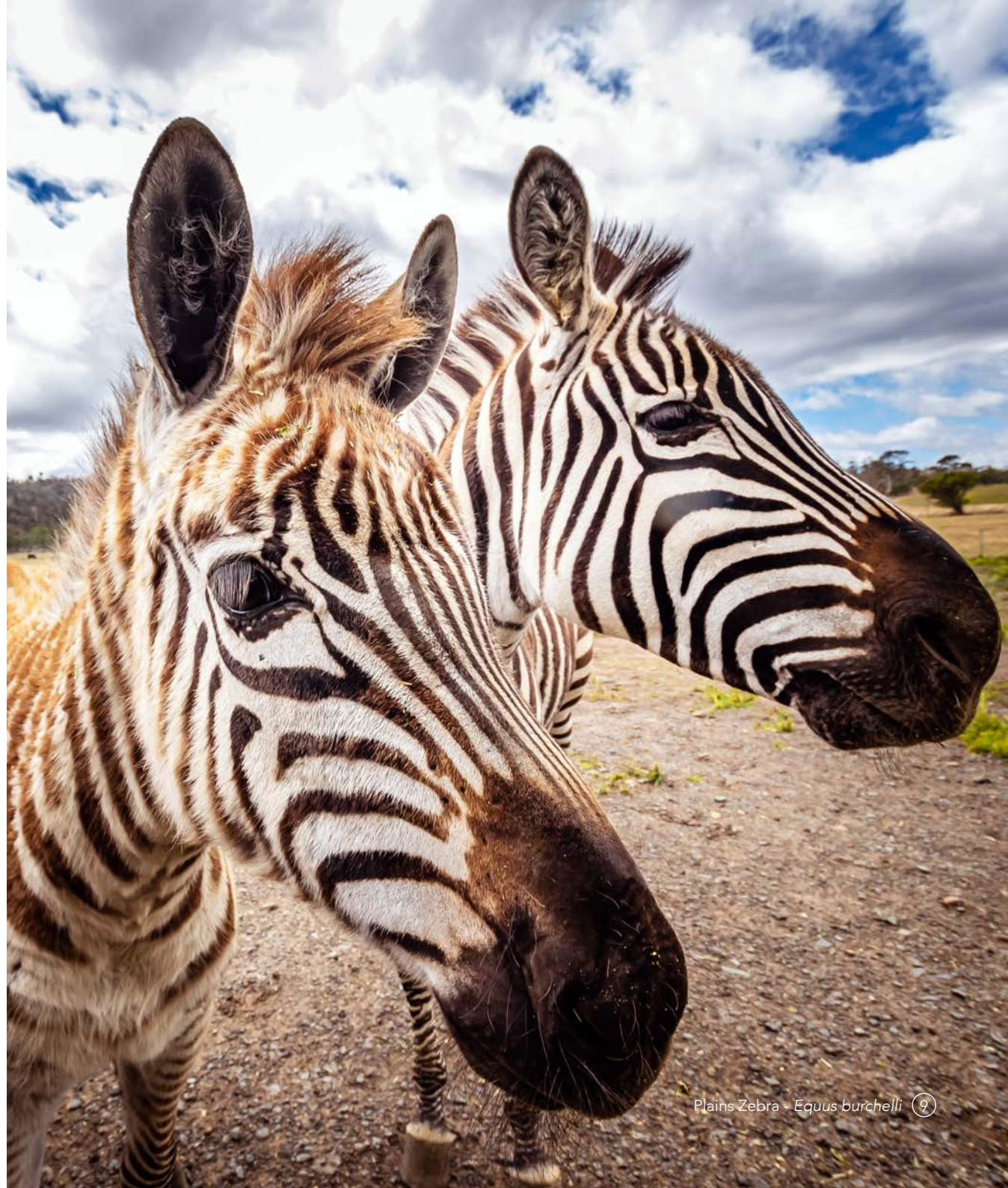
Plains Zebra - Equus burchelli ⓘ