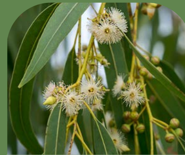
Blue Gum Eucalyptus globulus

Still widespread on mainland Australia, this kangaroo's range in Tasmania was reduced to less than 15% by the 1960's. Overhunted as a source of protein, the species has disappeared from much of its former range.